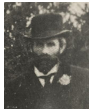
Edgar in 1903